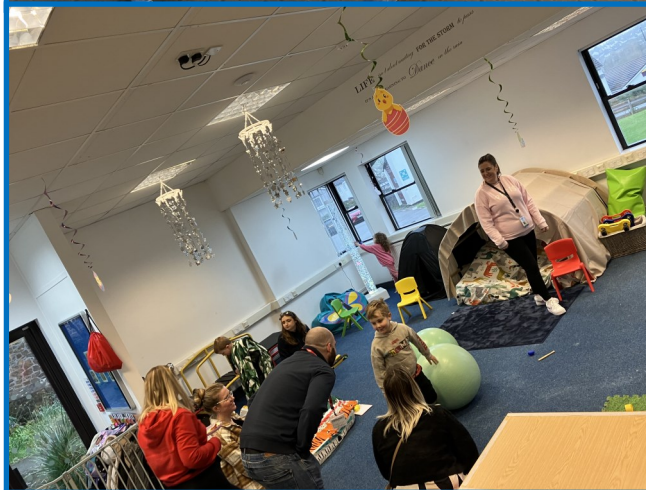
It was lovely to receive so many visitors throughout the day. Parents had the opportunity to visit class, meet with staff and to have 1:1 catch up sessions with their child's teacher.