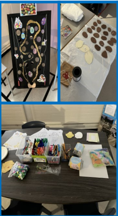
All around the school fun Easter activities were set up for the pupils to enjoy. Here you see a few in the Arts Studio.