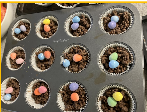
And cakes everywhere, the pupils had cooked up a storm.